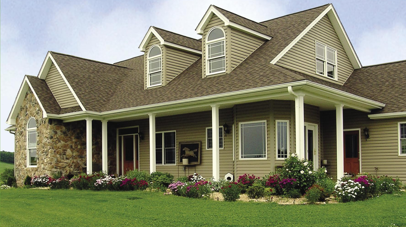
photo courtesy of Axelrod Designs, see page 145 for more information